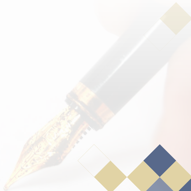
Justice Panachand Jain (Retd.)

A handwritten signature in black ink, reading "Panachand Jain". The signature is written in a cursive style with a long horizontal line extending from the end.