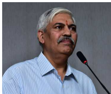
Shri BL Soni (IPS) ADG - Police CID CB Jaipur