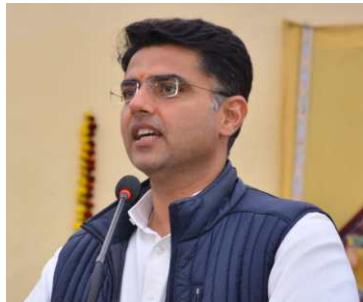
Shri Sachin Pilot Deputy Chief Minister Govt. of Rajasthan