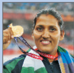
Krishna Poonia Padmashri, Olympian, Common Wealth Gold Medalist