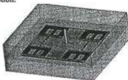
Fig: Product Design (Multi Cavity System)

product. Material properties which satisfy the need of the product selected. It solely depends upon the experience of the operator and past history of the product. Selection of polymer depends upon the area of application of the product. Properties of polymer like density, viscosity, coefficient of thermal expansion and compressibility plays a crucial role in quality of the product. Selection of polymer is done on the basis of history of the product and knowledge of operator. Past research work done on the material properties, material behavior inside the mold, orientation related and mechanical properties of product included in this section.