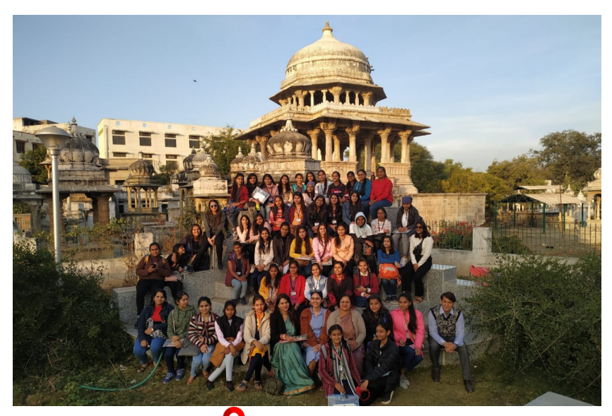
Site Visit at Royal Cenotaphs at Udaipur