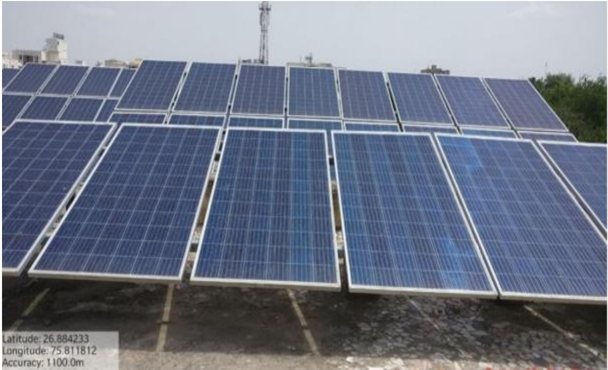
Solar Power Plant- Control Station