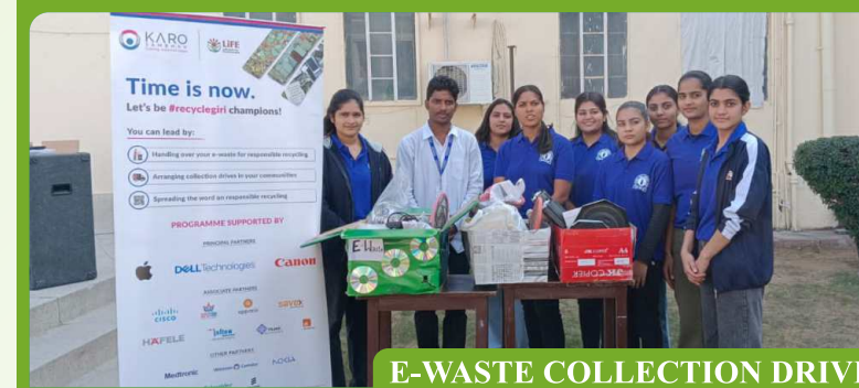
E-WASTE COLLECTION DRIVE