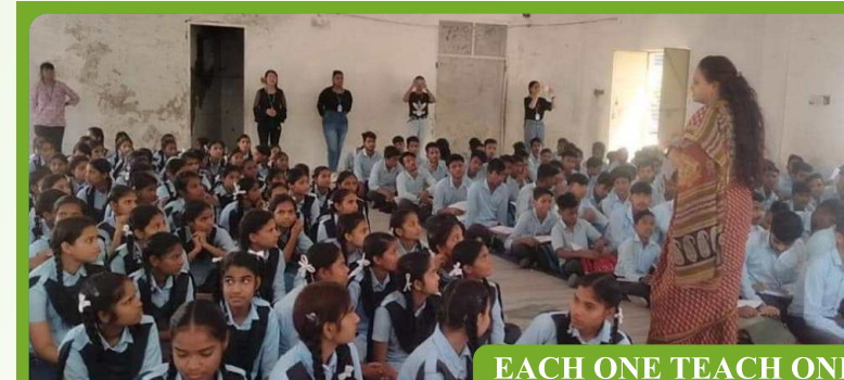
EACH ONE TEACH ONE