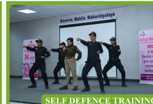
SELF DEFENCE TRAINING