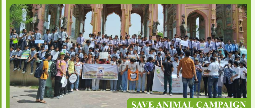
SAVE ANIMAL CAMPAIGN