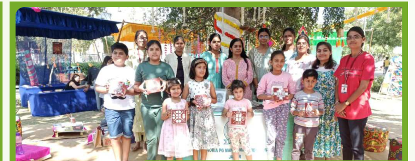
COMMUNITY OUTREACH BY D & P