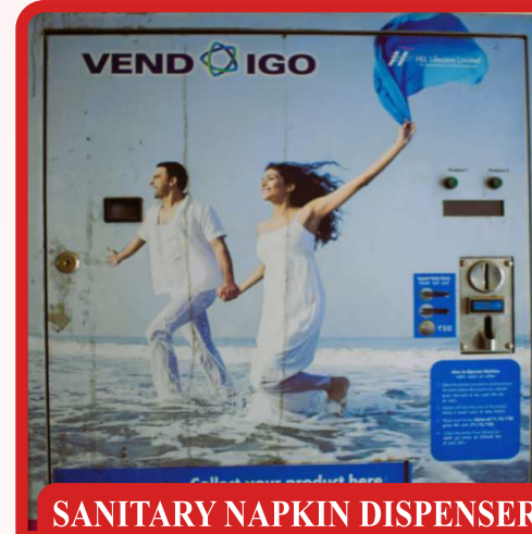
SANITARY NAPKIN DISPENSER