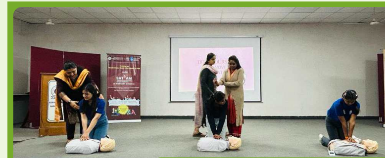
BASIC LIFE SUPPORT TRAINING